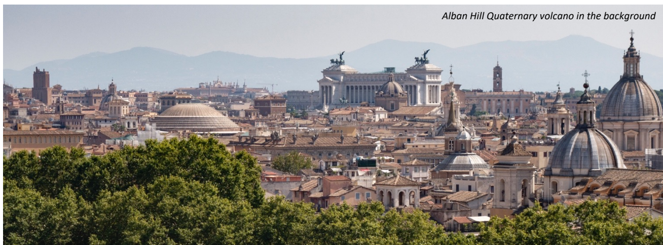
Alban Hill Quaternary volcano in the background

While organising the XXI INQUA Roma 2023, we are also focusing on sustainability. Firstly, because we want to take responsibility for the Society, we are part of, and secondly because we can save resources by thinking in different ways than we are used to. We will keep you informed about all the initiatives and we welcome your input to reduce the environmental impact of INQUA Roma 2023.