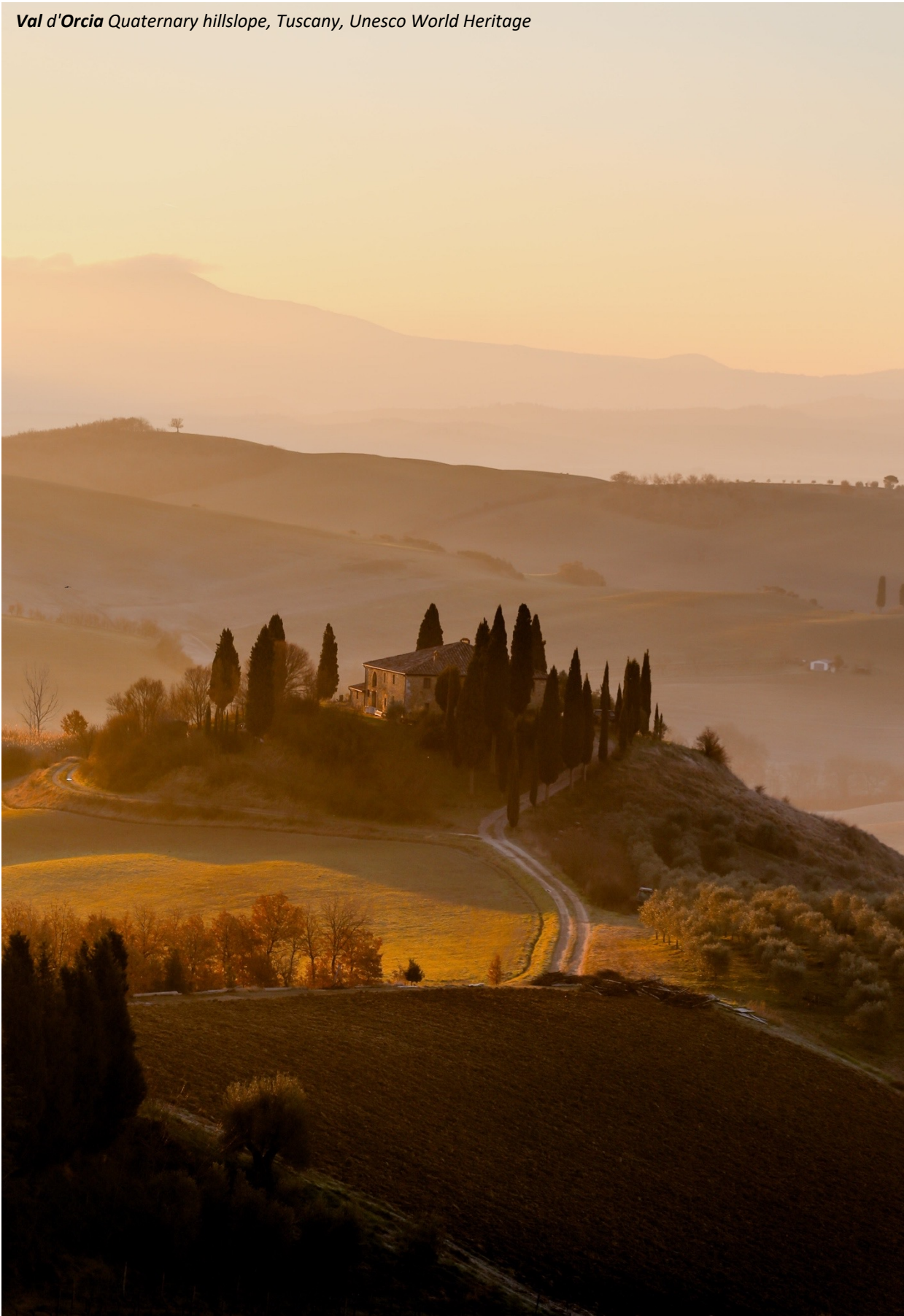
Val d'Orcia Quaternary hillslope, Tuscany, Unesco World Heritage