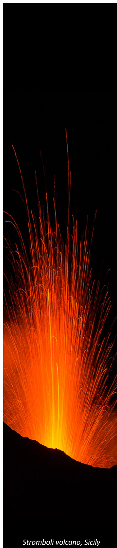
Stromboli volcano, Sicily