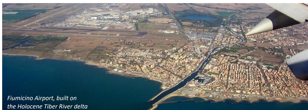
Fiumicino Airport, built on the Holocene Tiber River delta

Long-distance national and international buses use Autostazione Tiburtina. It is linked with the city centre by metro line B.